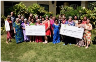
Daughters of the Nile Foundation presenting their check to the Shriners Honolulu Hospital and Egyptian Temple No. 33 presenting their check to the Shriners Hospital.