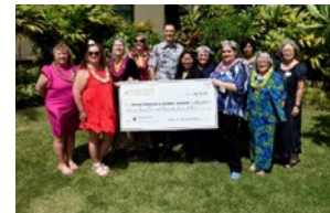
Check to the Shriners Honolulu Hospital for the Food Steamer and Bone Mill.