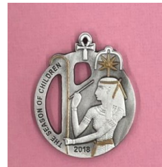
2018-Seshat 20th in the series