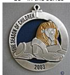
2003 – Sphinx 5th in the series