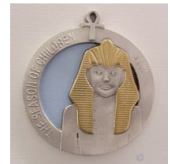
2009 – Hatshu 11th in the series