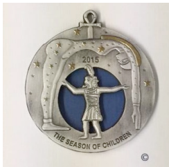
2015 – Nuit 17th in the series