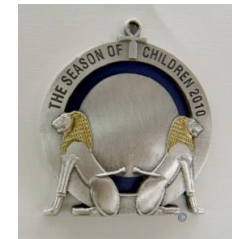
2010 – Aker 12th in the series