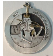
2013 – Wosret 15th in the series