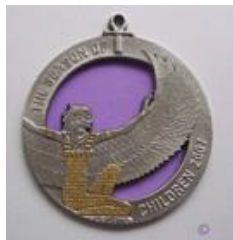
2007 – Isis 9th in the series