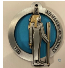
2023 - Hemsut 25th in the Series - Final