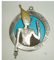
2011 – Ihy 13th in the series