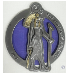
2022 - Sekhmet 24th in the series