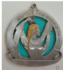
2012 – Cleopatra 14th in the series