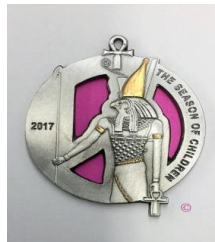
2017 – Horus 19th in the series