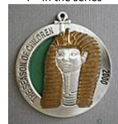
2000 – King Tut 2nd in the series