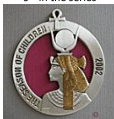
2002 – Hathor 4th in the series