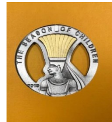
2019-Anuket 21st in the series