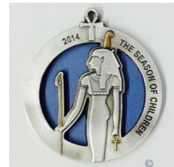
2014 – Maat 16th in the series