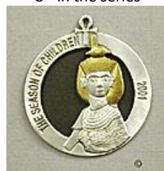
2001 – Selket 3rd in the series