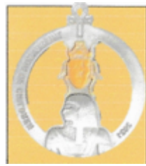
2021 - Khepri 23rd in the series