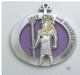
2016 – Hapi 18th in the series