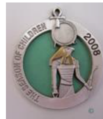
2008 – Ra 10th in the series