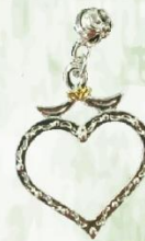
Gift of Love - Earrings -