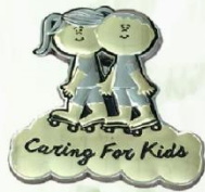
Skates Pin 2016