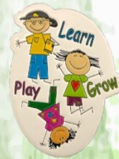
Happy Kids Pin 2018