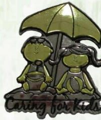
Beach Pin 2017