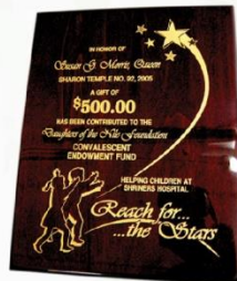
Reach For The Stars