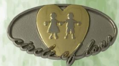
Circle of Love - Pin