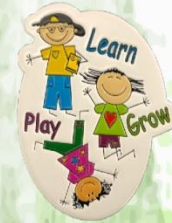
Happy Kids Pin 2018