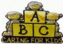
ABC Blocks 2015