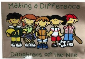
Making a Difference Lucite