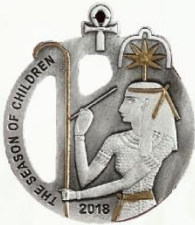
Seshat Ornament 2018