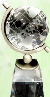
Serving Children Around the World