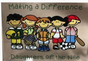
Making a Difference Lucite