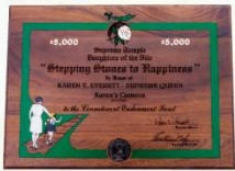
Stepping Stones to Happiness