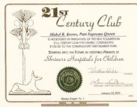
21st Century Club Certificate