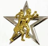
Reach For The Stars - Pin