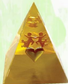
Pyramid of Commitment