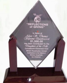
Reflection of Giving