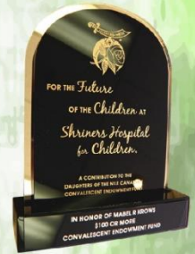
Giving For the Future