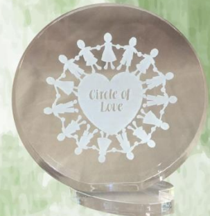
Circle of Love Lucite