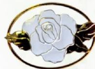
Pristine Rose - Pin