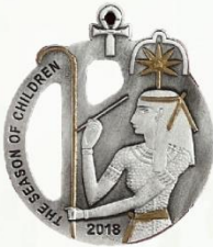
Seshat Ornament 2018