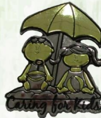
Beach Pin 2017