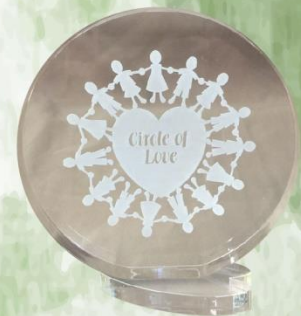
Circle of Love Lucite