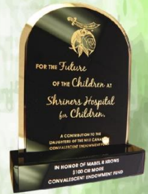
Giving For the Future