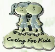
Skates Pin 2016