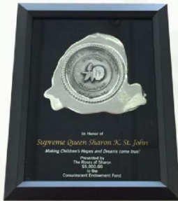
Hopes & Dreams