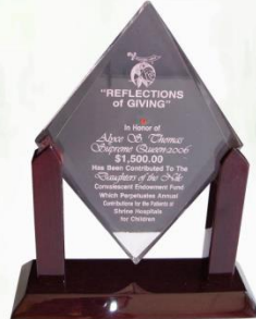
Reflection of Giving