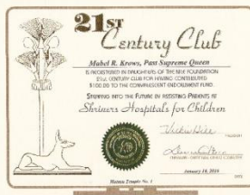
21st Century Club Certificate