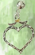
Gift of Love - Earrings -