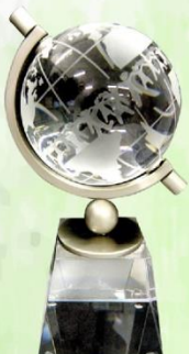
Serving Children Around the World