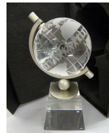
'Serving Children Around the World'

Another new item available from the Daughters of the Nile Foundation is a beautiful silk scarf with the white rose and a 'Working Together for the Children' design (photo at right). The scarf is available for $30 (plus S & H) with all proceeds going to the Convalescent Endowment Fund. Look for an order form on our website at www.donfdn.org or send a request for more information to contact@donfdn.org .