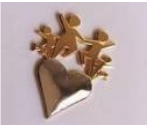
The Pyramid of Commitment is one of several My Gift incentive items available