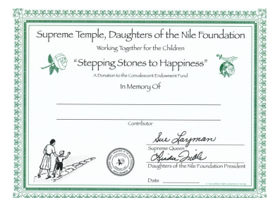
Stepping Stones to Happiness Certificates are available In Honor, In Memory or Contributor

Stepping Stones to Happiness certificates may be obtained using a major credit card from the Foundation website at www.donfdn.org or by sending a check/money order made payable to the Daughters of the Nile Foundation to: 411 Windsor Lane—Northwoods, New Braunfels, TX 78132-3837.