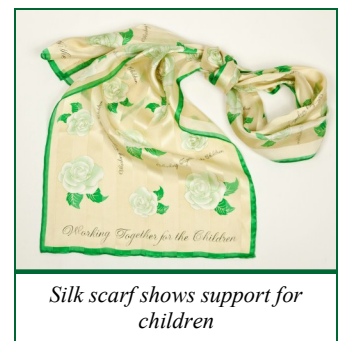
Silk scarf shows support for children