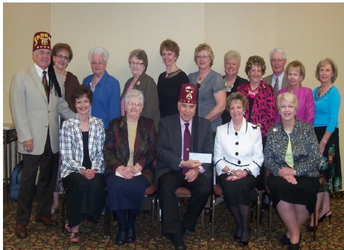
Foundation Board of Directors met with officials from Shriners Hospitals for Children®