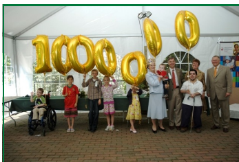
Children and parents were on hand to celebrate with Supreme Queen Vesta

extraordinary gift they are making today, they are contributing to improve the quality of care and quality of life of the children and their families, as well as addressing the day-to-day needs of the children by providing arts and crafts materials and games for our child life department.”